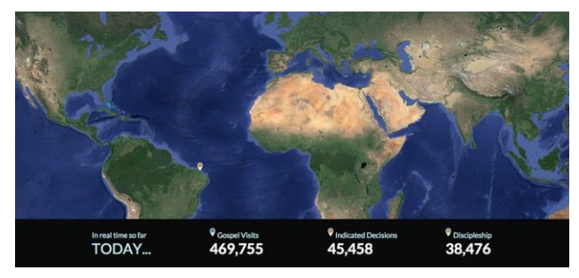
GMO has a map on its website GlobalMediaOutreach.com that shows live updates as people visit its websites, make decisions for Christ, and continue in online discipleship

GMO places online ads on websites and mobile phones to direct seekers to online gospel presentations on GMO websites or other platforms. Seekers are presented with a gospel presentation in their language, in a culturally relevant context, and the opportunity to pray to accept Jesus Christ as Lord and Savior. They can then indicate by clicking "Yes" or "No" if they prayed to accept Christ. Seekers who click either option are presented with options to connect with an online missionary, download a Bible, and access discipleship resources. A trained online missionary receives the request to connect and reaches out via email/social media or text message with prayer, resources, and biblically-sound answers to questions. Seekers are encouraged to respond and continue to ask questions. Online missionaries also help seekers find a local church or mission organization if needed.